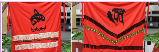
King and Queen's Traditional Cape and Aprons